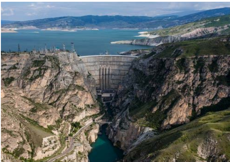
Fig. 1 Chirkeisk Dam, Dagestan Republic, Russia. Although strong-motion sensors are already deployed on the dam, this project required an array of broadband seismometers to detect and characterise regional earthquakes.

The Sulak river in Dagestan, SW Russia, generates 1780 MW of power via a cascade of hydroelectric dams. The whole river lies within the seismically active Iran-Caucasus-Anatolia region which has experienced multiple M_0 6.0+ earthquakes in recent history and has the potential for a M_0 7.0+ in the near future. An array of 13 Güralp 6TD digital broadband seismometers transmitting real-time data for analysis provides an automatic remote sensing system, with Güralp instruments chosen for their ability to overcome field and network restrictions whilst simultaneously providing excellent quality data.